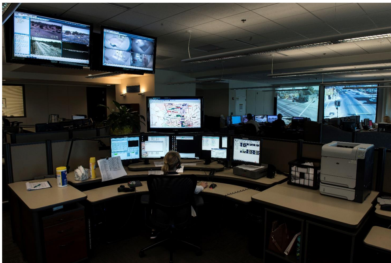
Figure 3: Stockton Police 911 Center 6

The SPD command staff was able to monitor the pursuit via radio traffic, as well as view segments of the pursuit through an extensive traffic camera system in the City of Stockton 5 . Several workstations and large video screens, as seen in Figure 3, are located within the SPD dispatch center. The cameras are monitored during certain parts of the day by staff, some of whom are retired SPD officers. During the pursuit, the camera operators were able to listen to the pursuit and adjust the cameras in anticipation of the suspects' travel, providing SPD commanders with additional information.