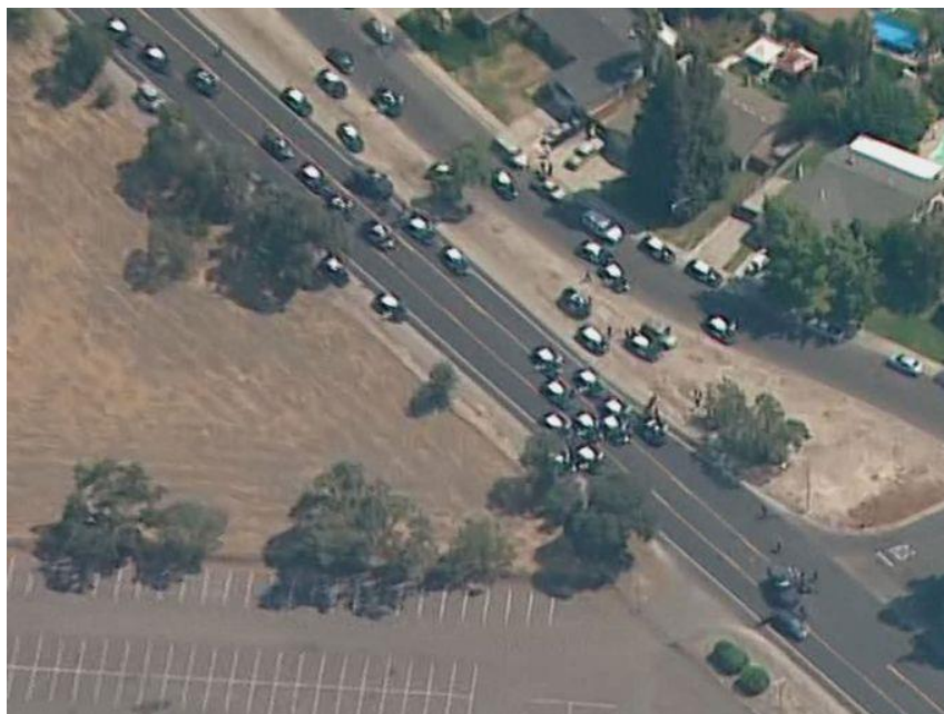
Figure 1 Final Stop Location Overhead View 9

continued to shoot at responding officers. There the scene became even more chaotic with dozens of officers arriving and no response plan in place.