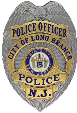
City of Long Branch (New Jersey) Police Department badge