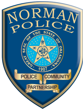
Norman (Oklahoma) Police Department badge